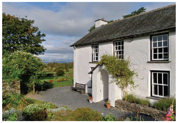
In 2008, provisional data suggests that drinking water from houses with private wells may be a highly significant factor in the increased number of VTEC cases reported.

Regional variation was noted in the numbers of cases reported, as shown in table 3. The highest incidence rate for VTEC overall was reported in the HSE-NW - in part due to the 52 probable cases reported which were associated with an outbreak during August 2007. However, even when only confirmed cases are included, the incidence rate was 7.2 per 100,000. The HSE-M also reported a relatively high incidence rate of 7.2 per 100,000.