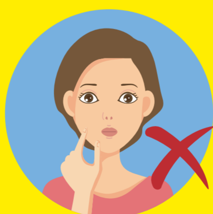
Avoiding touching the face