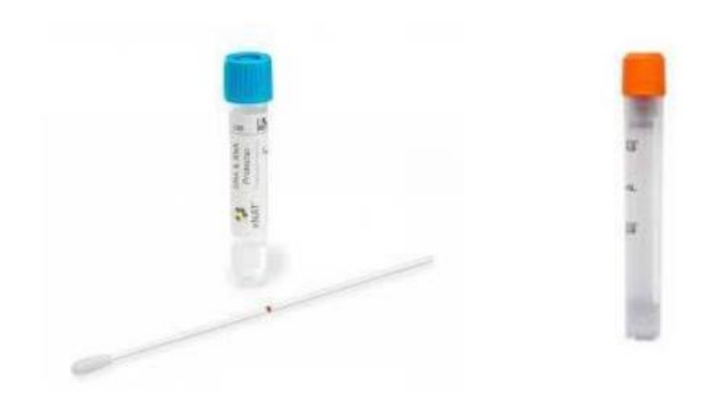
Figure B Lysis swabs