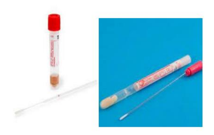
Figure A Copan (VTM) swab