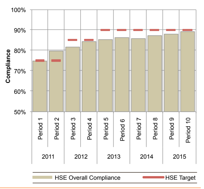
Figure 2: Summary of hand hygiene compliance in HSE acute hospitals in Ireland for the last eight national audit periods, 2011 to 2015. The HSE target for each year is shown as red lines.

Figure 1: Summary of hand hygiene compliance in acute hospitals in Ireland combined for the two national audit periods in 2015. The 95% confidence intervals are shown in bars and the HSE target for 2015 (90%) is shown as a red line. Note that data from private hospitals were excluded for the Staff Categories and WHO 5 Moments.