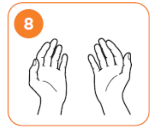
Once dry, your hands are safe