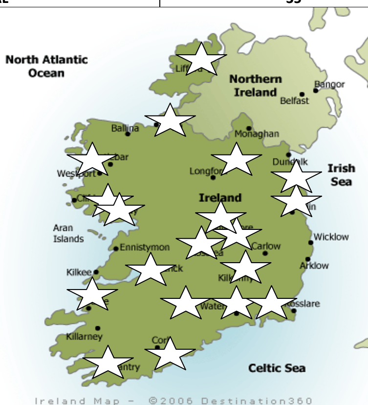
Figure 1. Map illustrating location of participating hospitals