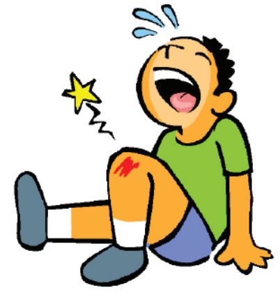
Touching a cut or open sore